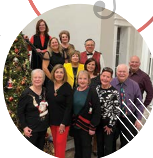
PSO Guild Members

To become a member of the PSO Guild, please call 972-473-7262.