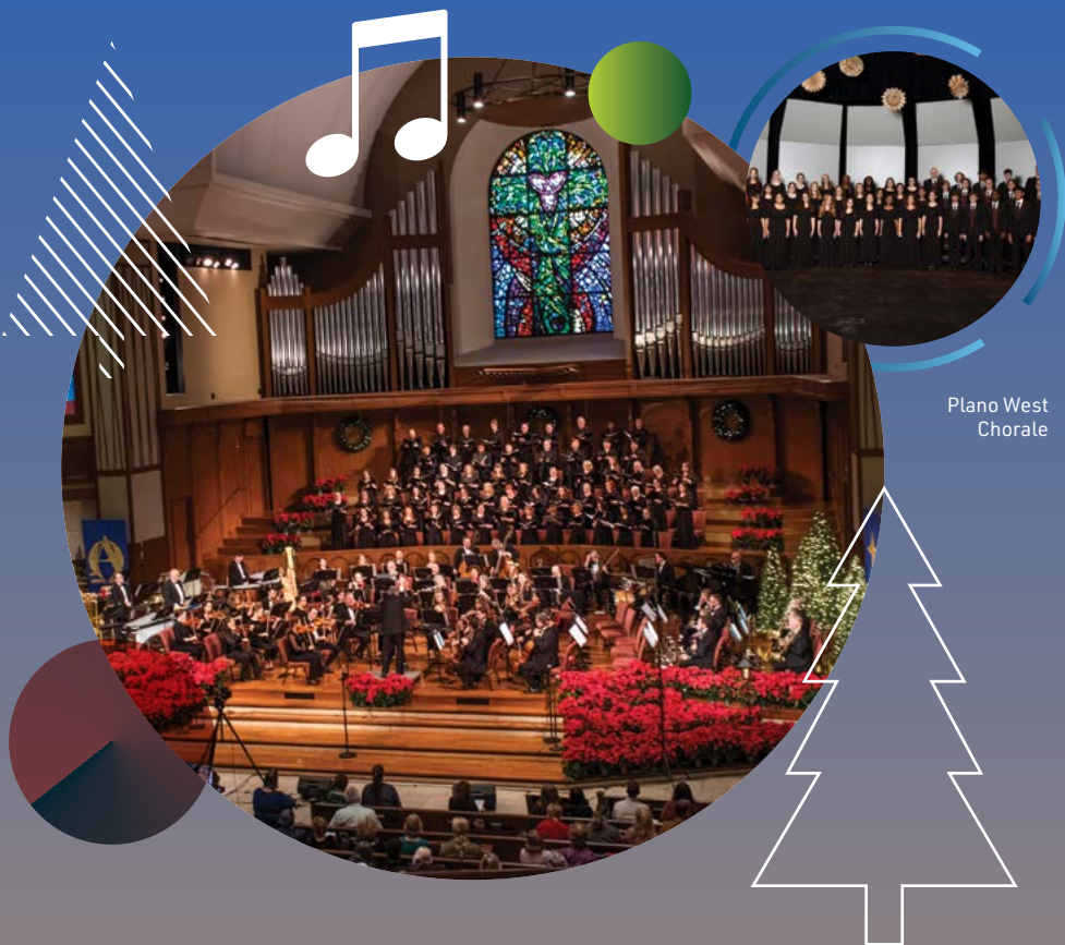
Plano West Chorale