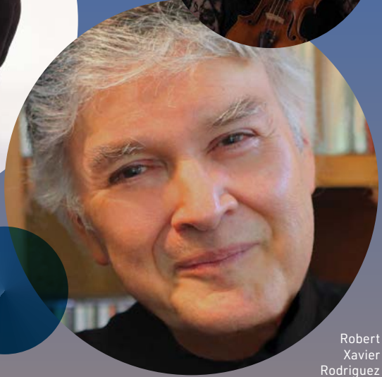
Robert Xavier Rodríguez